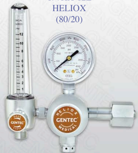
197HX-12L HELIOX (80/20)

5 year warranty (see warranty statement for details)